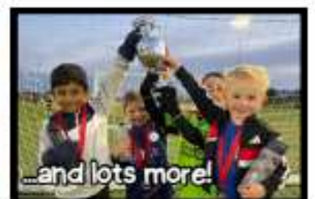
...and lots more!