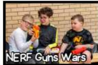
NERF Guns Wars