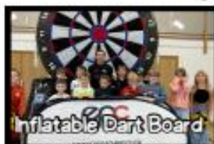
Inflatible Dart Board