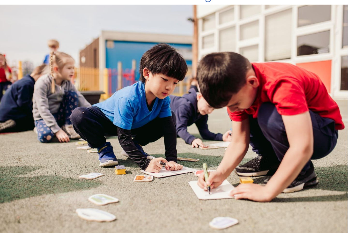
"Children in Reception make excellent progress in developing very positive attitudes to learning, respecting others and knowing that they must take responsibility for how they behave." Ofsted

Our Early Years provision is one of our greatest assets. We stimulate children's natural curiosity, nurture their capacity to learn, enable them to form respectful relationships and to express themselves as individuals. Activities are based on each child's individual strengths and needs and encourage them to develop their capacity for independent thought and self-expression – something that, in turn, helps to develop their self-confidence and love of learning.