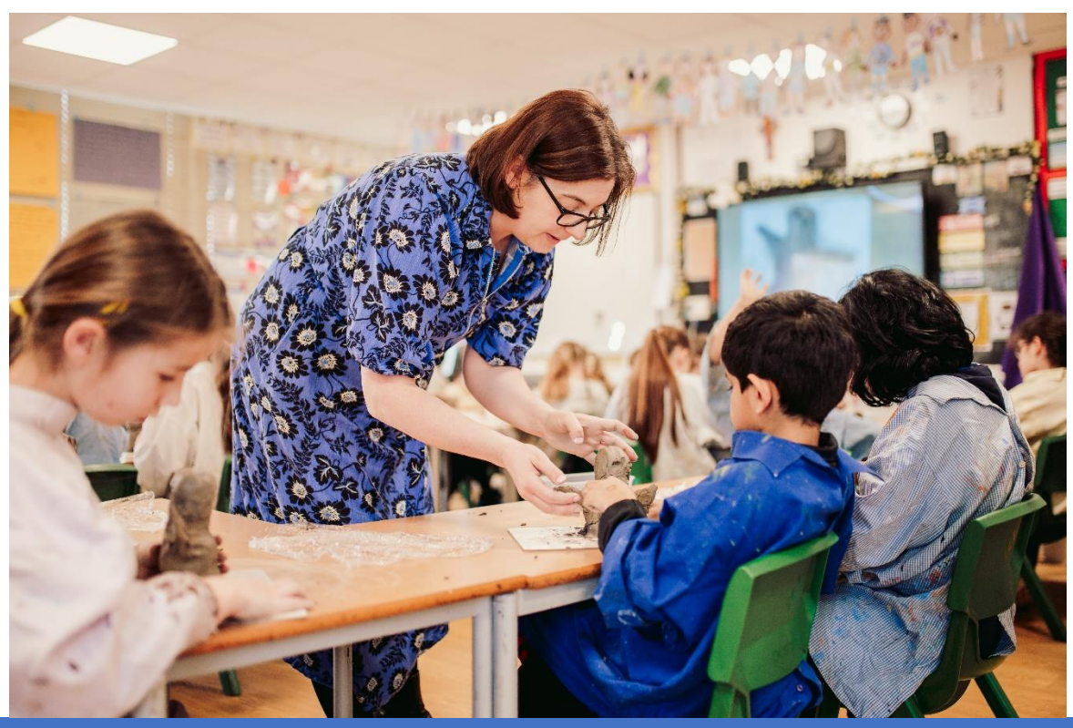
"The work for individual pupils is planned exceptionally well because it is based on secure assessments of what each pupil knows and needs to learn next." Ofsted

We value making learning memorable and therefore, theme lessons around inspiring ever-evolving topics and creative, exciting resources. We believe theming learning around topics makes the content meaningful, contextual and relevant for pupils. Having a cross-curricular approach enriches the balance and breadth of our curriculum, building learning by linking it together.