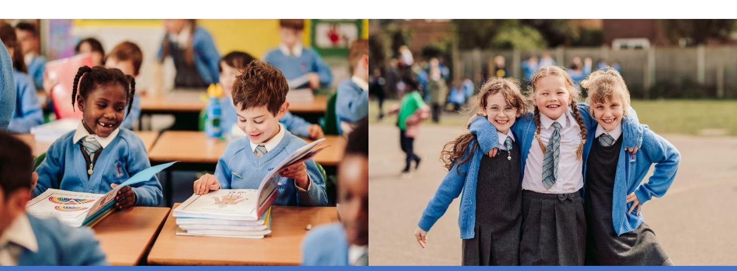
'Pupils take pride in belonging to their school community. They are polite to each other and to visitors. Many pupils have leadership roles in the school such as head boy and head girl or as members of the school council. They take their responsibilities seriously.'

Our Global Warriors are representatives from each class who work hard to ensure that the school is as ECO friendly as possible and that everyone takes responsibility to live by the St. Teresa's ECO Code.